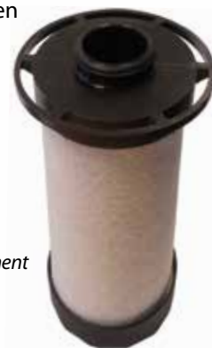
ZFC™ No-Touch Element